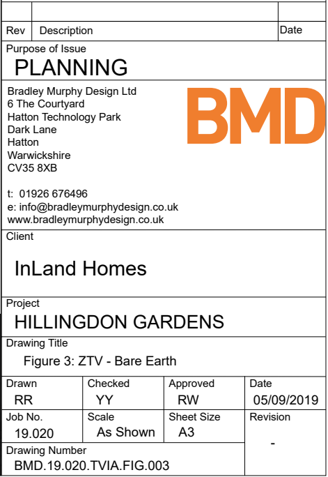
Figure 3 : Zone of Theoretical Visibility Bare Earth, represents the worst case scenario. This treats landform as if it were 'bare earth' and illustrates the area within which the development would theoretically be visible assuming other vertical features within the landscape and built environment (such as buildings, infrastructure and vegetation) would not act as barriers to views toward the development.